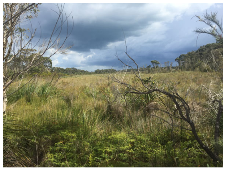
Figure 9 View over Ananarawai Swamp plain, showing 'swamp islands' in the distance.

usually ceased with nightfall, <sup>222</sup> as did the 'Narawai battle. <sup>223</sup> Traditional fights often concluded with opposing sides feasting and corroboreeing. <sup>224</sup> This certainly occurred after 'Narawai: 'All hands, including old men, women and children, walked up to Dunwich in a crowd, the soldiers giving them biscuits and tobacco, and the natives returning the compliment with fish and oysters. <sup>225</sup>