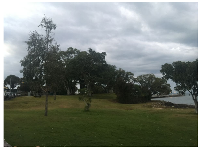
Figure 3 Site of former military barracks (risen area in background), Dunwich.