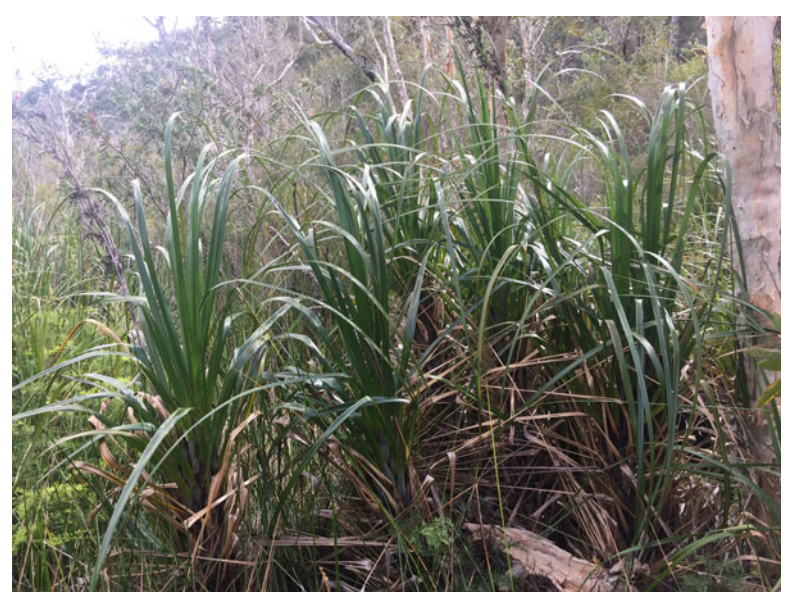
Figure 6 Cut grass at Arananarwai swamp.