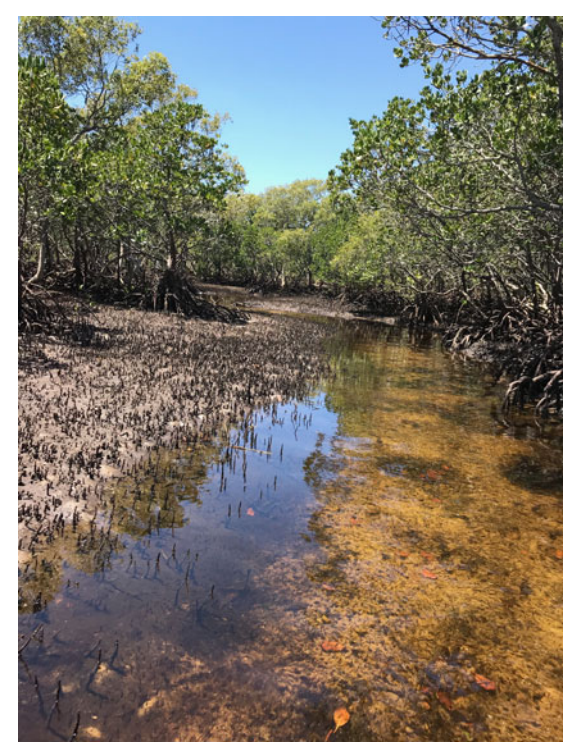
Figure 7 'Narawai Creek near the foreshore.