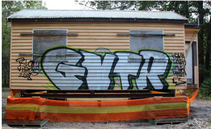
St Peter's Church in Amity Point on blocks and ready to move last month.

The street where the building was originally located